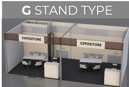
G STAND TYPE