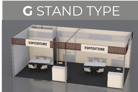
G STAND TYPE

Black adhesive (support's net size 180xh40 cm)