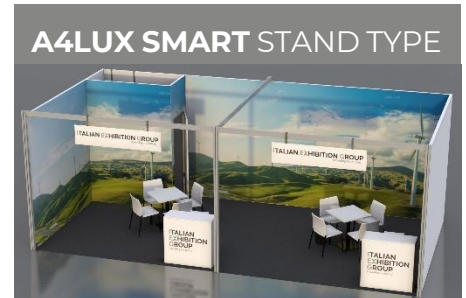
A4LUX SMART STAND TYPE