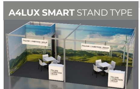
A4LUX SMART STAND TYPE

Black adhesive (support's net size 180xh40 cm)