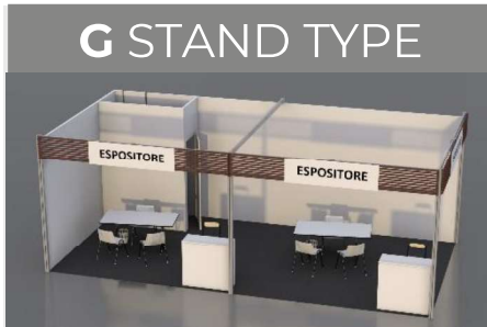
G STAND TYPE

Black adhesive (support's net size 180xh40 cm)