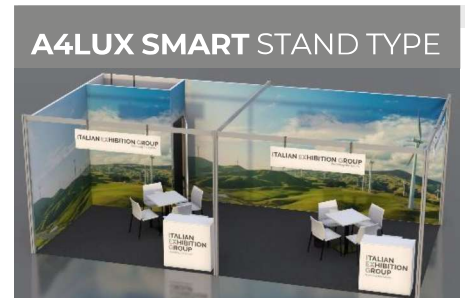
A4LUX SMART STAND TYPE

Black adhesive (support's net size 180xh40 cm)